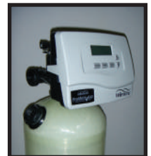
optional fill port

Acid Neutralizing Filtration System – These systems are recommended for pH adjustment for waters of pH 6.0 - 6.9. The system uses a self sacrificing media which has to be refilled periodically. Typical signs of low pH are blue green stains. Fill port option available. Does not include insulated jacket.