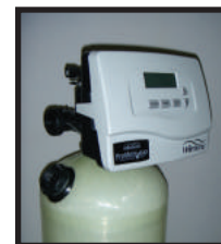
optional fill port

Acid Neutralizing Filtration System – These systems are recommended for pH adjustment for waters of pH 6.0 - 6.9. The system uses a self sacrificing media which has to be refilled periodically. Typical signs of low pH are blue green stains. Fill port option available. Does not include insulated jacket.