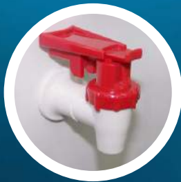
Tomlinson™ Touch Guard® hot water faucet